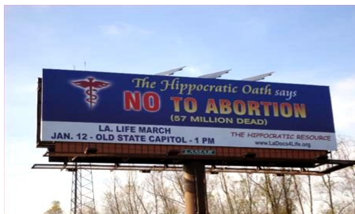
I-10, East-facing, at Sorrento Exit