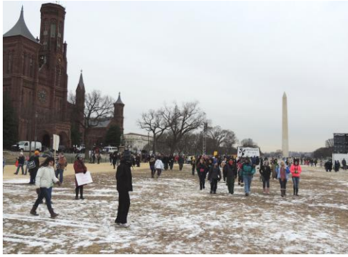
Gathering on the Mall on a wintry day ...