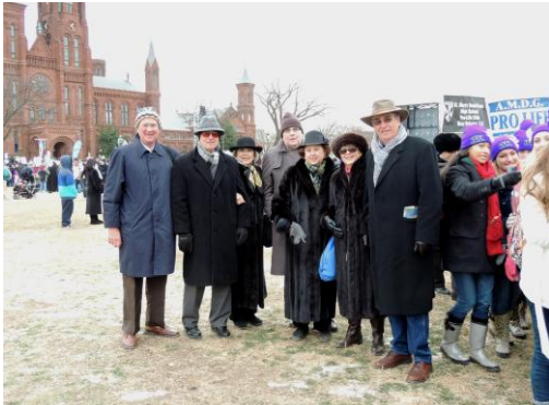
Some Louisiana Right to Life leaders ...