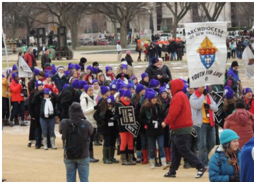
New Orleans Youth begin to assemble ...