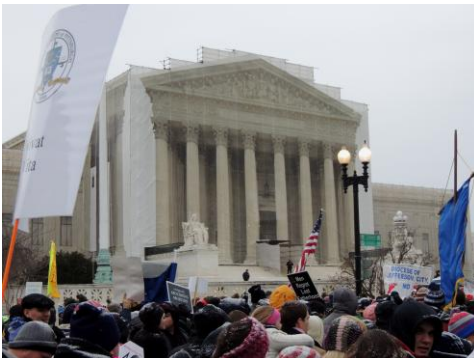
Destination attained ...