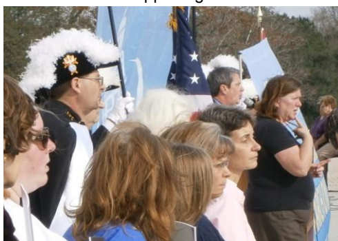
Senator Vitter denouncing ...