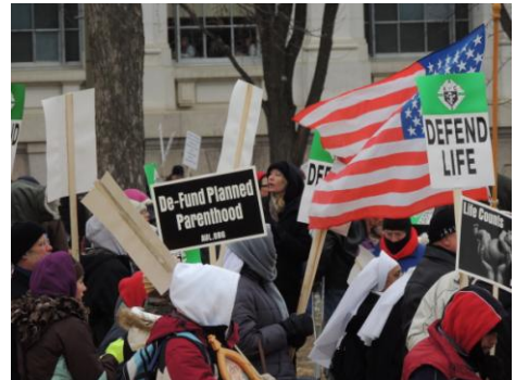
"Geaux forth ..."