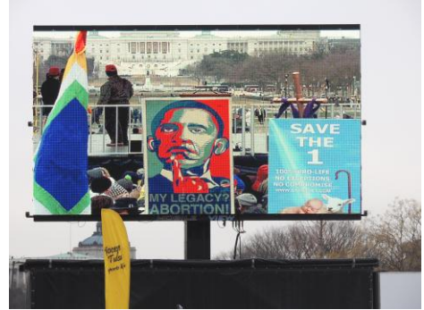
Obama's abortion legacy on the giant screen ...