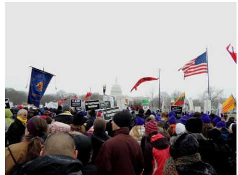
On to the Capitol & the Supreme Court ...