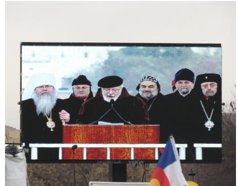
Cardinal O'Malley and Orthodox leaders ...