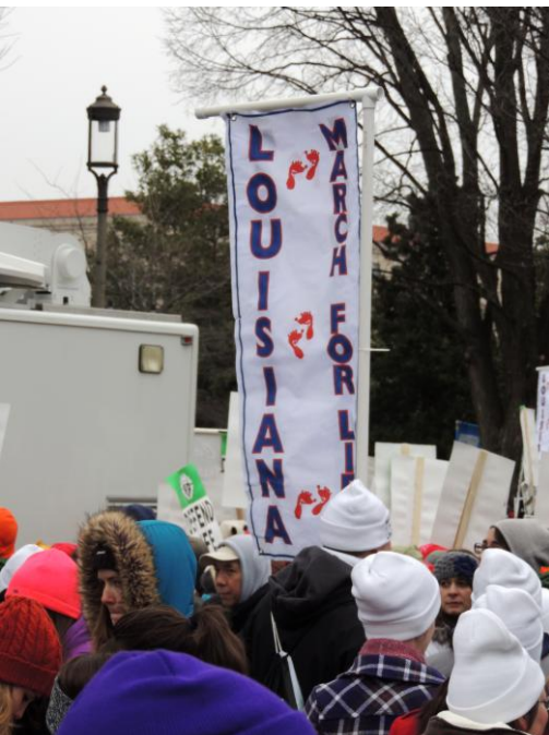
Louisiana on the March ...